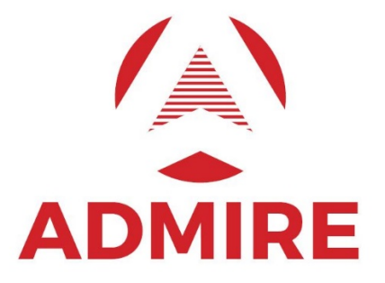
Figure 1 – ADMIRE logo, version 1

Underpinned to the logo design there are some ideas and concepts explored in the project: layers, which is commonly figurative representing additive manufacturing; a triangle-shaped arrow illustrating the triangle of knowledge and innovation, the circle around the triangle are the relevant stakeholders and community engaged along the project. Lastly, the red colour is associated to energy and power.