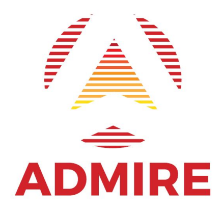
Figure 2 – ADMIRE logo, version 2